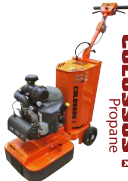
COLOSSOS Propane XT